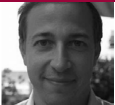
Michael Rauch Writer and Executive Producer for film and television. Creator and EP of the CBS series Instinct . Additional credits for TV include Royal Pains and Beautiful People .