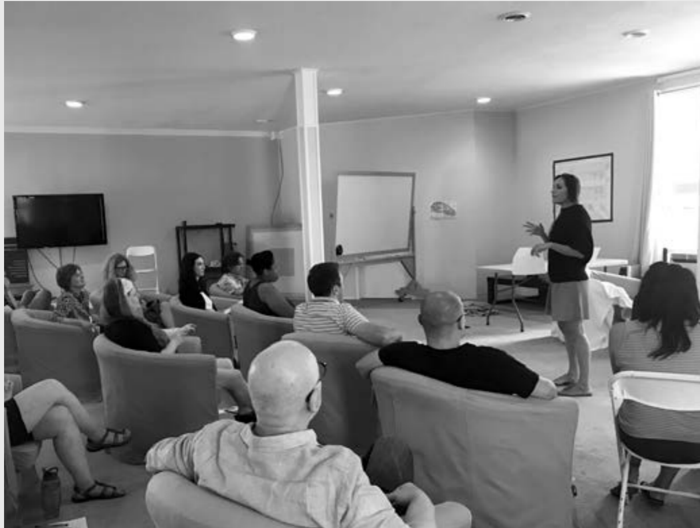
Students present their work to their classmates at residency writing workshops.