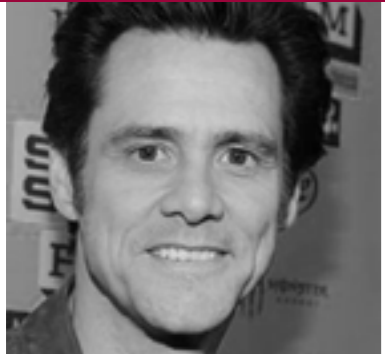
Jim Carrey Legendary actor, comedian, writer, producer and painter. A four-time Golden Globe Award nominee.

The David Lynch MFA draws on industry experts, academics and professionals from all areas of screenwriting, film production and distribution. Speakers from past years have included the following: