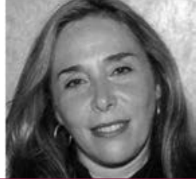
Susan Seidelman Pioneering Producer/Writer/Director of films including Smithereens , Desperately Seeking Susan , Making Mr. Right , Cookie , as well as the television series Sex and the City .