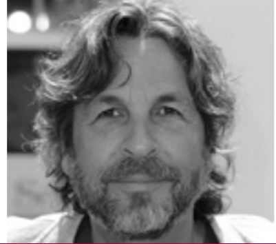
Peter Farrelly Known for such hits as Dumb & Dumber , There's Something About Mary , Shallow Hall and Green Book