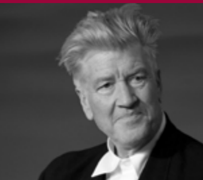
David Lynch Iconic works includes Eraserhead , Wild at Heart , Blue Velvet , Lost Highway , Mulholland Drive , Island Empire and Twin Peaks .